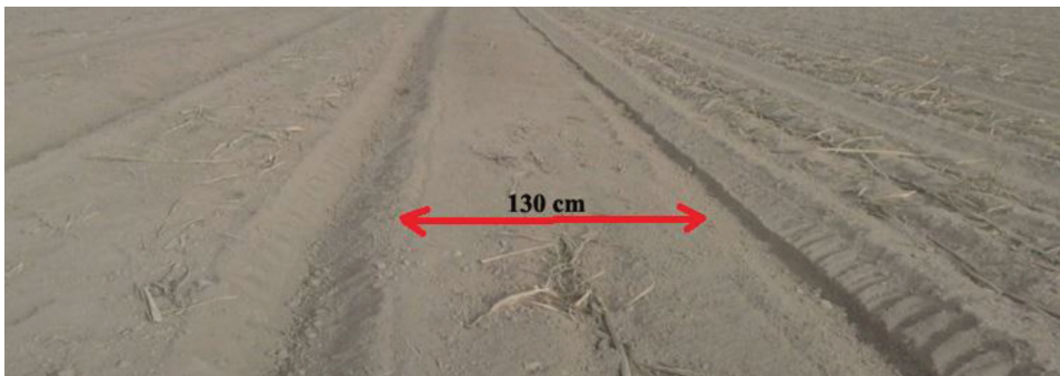
Figure 3. The width of ridge in triple-row planting