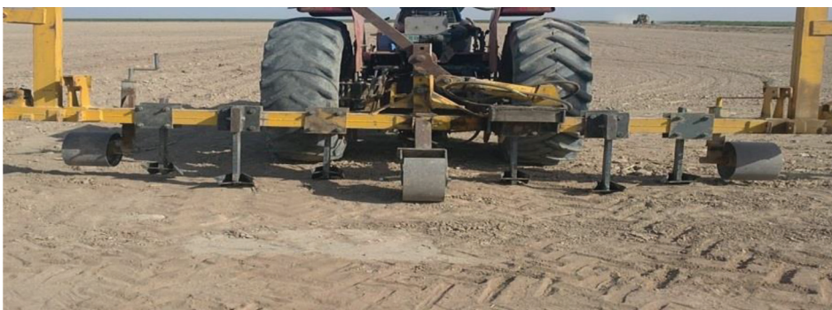
Figure 1. Triple-row furrower