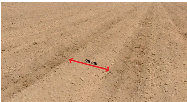
Figure 4. The width of ridge in double-row planting