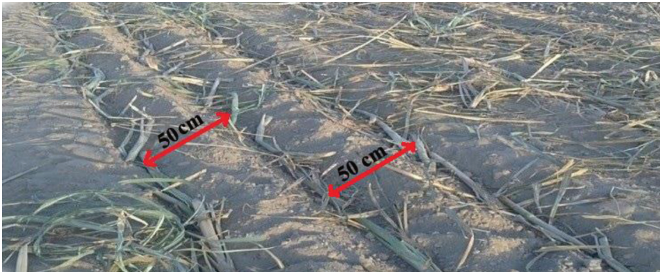
Figure 2. The sugarcane cuttings in triple-row planting