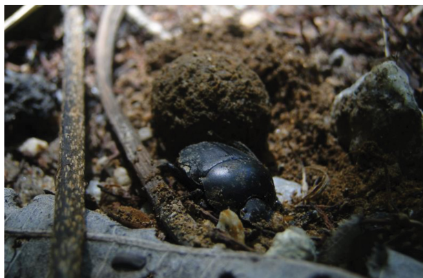
Figure 1. Dung beetle Paragymnopleurus maurus making a dung ball and ready to roll it to other places

beetles of the species Paragymnopleurus maurus (Figure 1 & Figure 2) consumed primate faces as their main food source from this area.