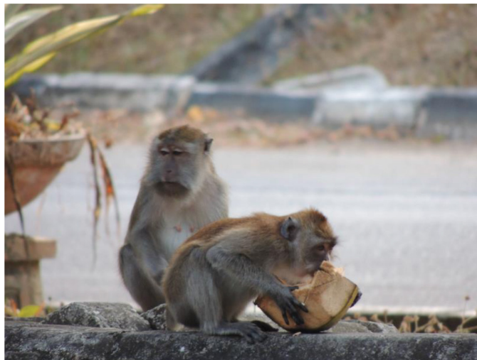
Figure 4. Macaca fascicularis (Long-tailed macaque) enjoying food in Langkawi Island, Kedah, Malaysia

sequence obtained from the PCR product had 98% specificity to the database sequence of M. fascicularis , agreeing with the Max Identity and an E-Value \leq 0 . The specifically designed primer successfully amplified the targeted loci, and the overall molecular approach confirmed that the faces rolled by P. maurus on Langkawi Island belonged to a single species, M. fascicularis (Figure 4).